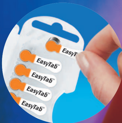
EASY TO REMOVE

Activair with EasyTab is now easier than ever to change.