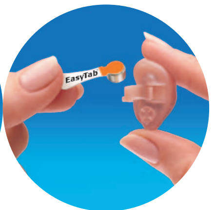
EASY TO INSERT