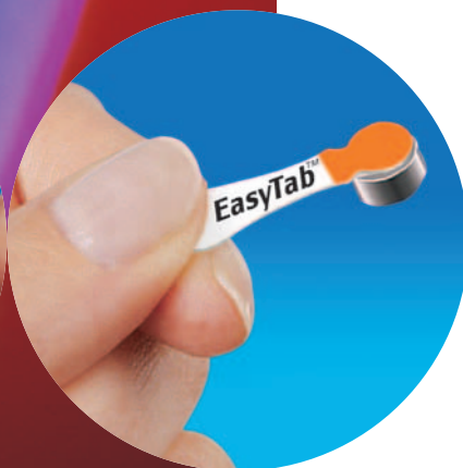
EASY TO HOLD